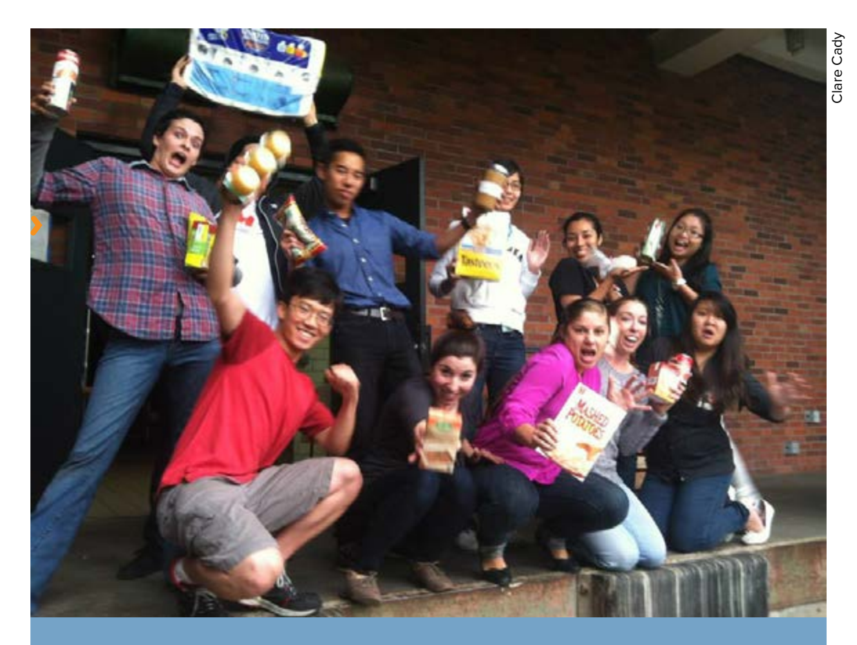
Staff from Oregon State University's Human Services Resource Center run OSU's Emergency Food Pantry.

Once the steering committee is up and running, you need to make sure the group communicates effectively. The committee should meet weekly during the planning process in order to move the project forward, but should be able to switch to monthly meetings once the pantry is up and running. In addition, you should send out frequent email updates to the committee members to keep everyone apprised of the latest developments.