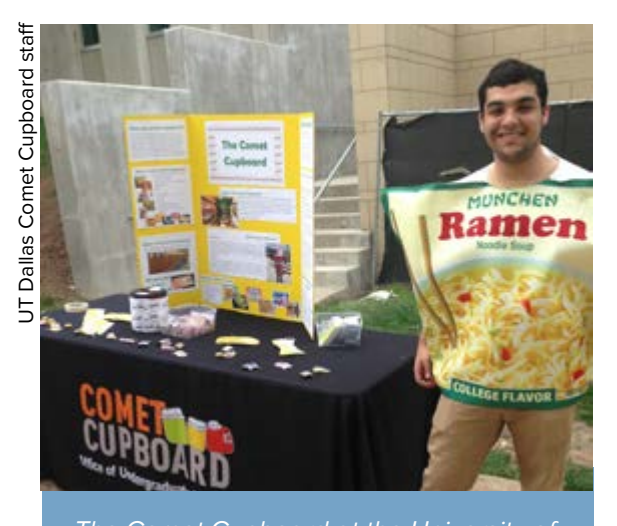
The Comet Cupboard at the University of Texas at Dallas tables on campus to raise awareness about the pantry.

Here are some tips on how to make your survey gathering successful.